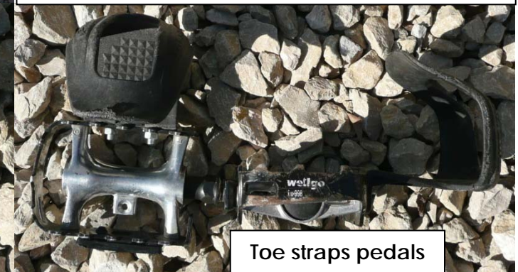
Toe straps pedals